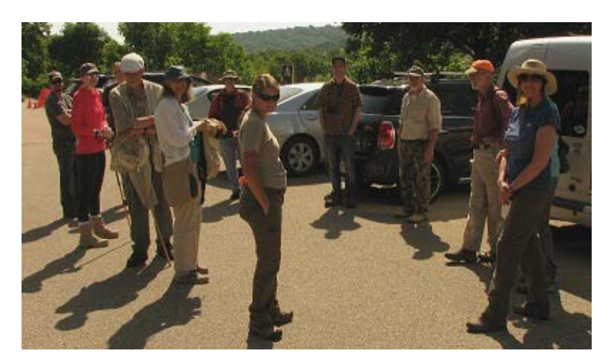
Folks arriving for Swiss Valley Foray