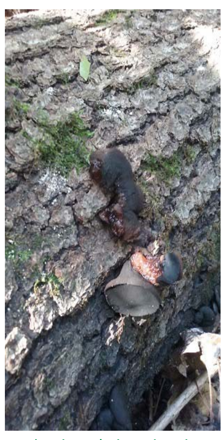
Showing gelatinous interior