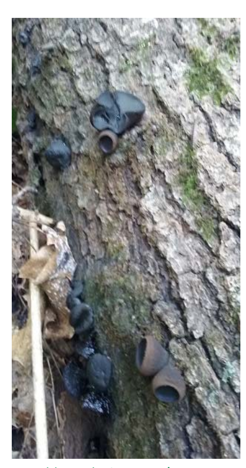
Older gelatinous at bottom