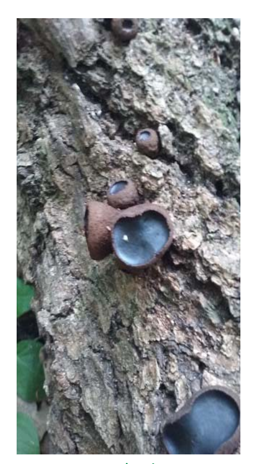
Young Bulgaria cups

More importantly Bulgaria and many other sampled species will now be archived and available for future research at the Ada Hayden Herbarium.