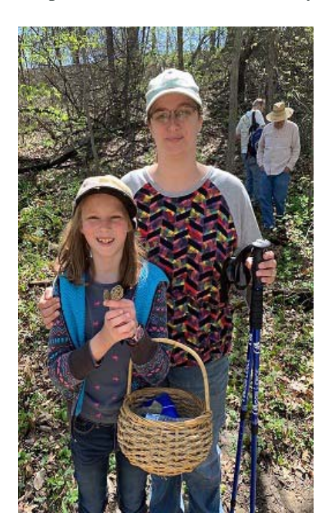
Mom and daughter displaying morels at Discovery Park

We had great forays at some new places this year including Discovery Park in Muscatine on May 4<sup>th</sup> where both kids and adults were finding little morels like an Easter egg hunt. Another new foray location was Swiss Valley near Dubuque on June 29<sup>th</sup> where a large turnout of folks enjoyed beautiful scenery and amazing fungi and insect interactions. Check out pictures of these and other forays on the PSMC website: http://www.iowamushroom.org/forays.php